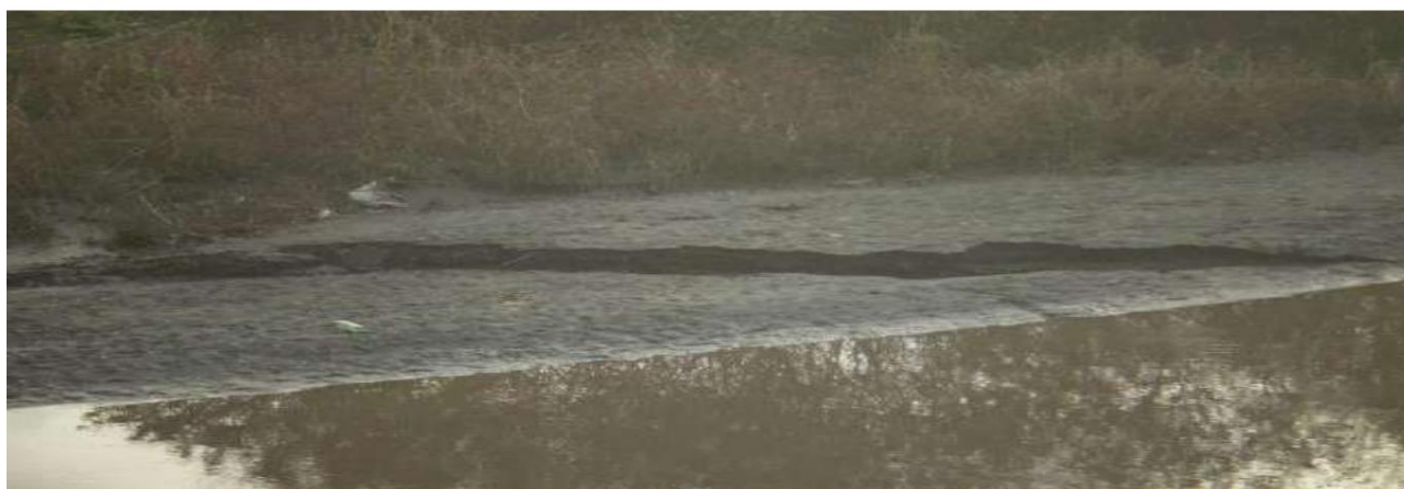
Figure 4.1. Sediment of the river Spreya immediately before its confluence with Lake Modrac

A special danger to the ecosystem of Lake Modrac is the intake of sediment loaded with heavy metals, based on the research carried out as part of the preparation of this document, it can be concluded that it is necessary to undertake urgent activities related to the cleaning of alluvial sediment from Lake Modrac, considering its ecotoxicity and the reduction of the useful volume of the lake as a water object that has the role of flood protection. Figure 4.1 shows the appearance of the sediment at the measuring site S-1.