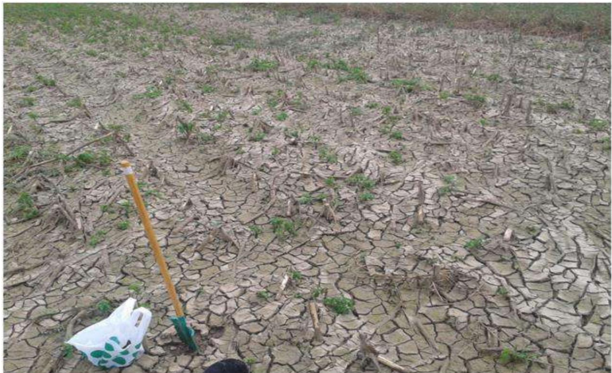
Figure 5.2. Layout of the agricultural soil sampling area after the 2014 floods.