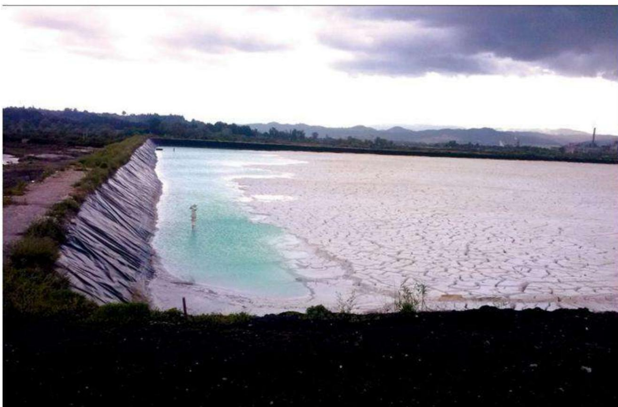
Figure 6.1. The appearance of the active settling tank white sea Sisecam Soda Lukavac

Based on the results shown in table 6.1. it can be concluded that the overflow from the white sea sedimentation plant contains extremely high chloride concentrations. According to previous research, chlorides have been designated as a pollutant with a devastating effect on the environment, in lower concentrations they are necessary for all organisms, however, at high concentrations, they have a toxic effect. Chlorides are chemical indicators of pollution and are permanent components of industrial and municipal waste water, they are designated as a pollutant with a devastating impact on the environment. They are found in the form of sodium, calcium and magnesium salts, most of the mentioned salts are soluble in high concentrations, the saturation of water with sodium chloride is 360 g/kg of water (at 25 °C), which corresponds to the amount of 218 g of chloride ions per kilogram of water. In addition to industrial and municipal waste water, chlorides also reach surface and especially underground water during the use of artificial and manure as a consequence of the pollution of underground water under agricultural land.